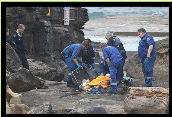
Rescuers with plane crash survivor