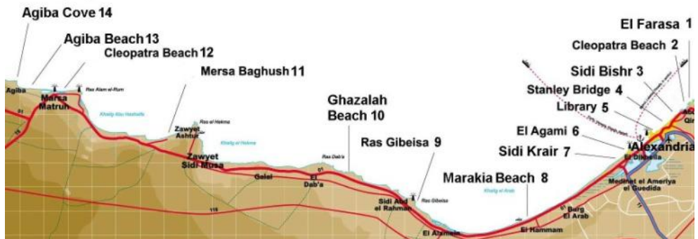
Map of the Beach Breaks in Alexandria Egypt